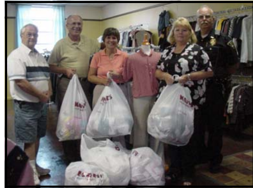
Members of the Pendleton Lions Club present Outfitters with $1,000 worth of socks and underwear.

Outfitters, Inc. is a non-profit 501(c)3 charitable organization. All donations are tax deductible.