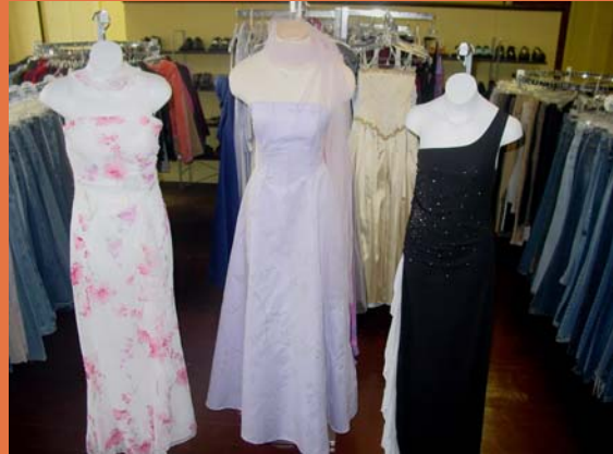
OUTFITTERS PROVIDED A GREAT SELECTION OF PROM DRESSES, SHOES AND JEWELRY TO THEIR HIGH SCHOOL CLIENTS

A big thank you to all the businesses and individuals who helped make Prom Night a very special night for Outfitters' clients!